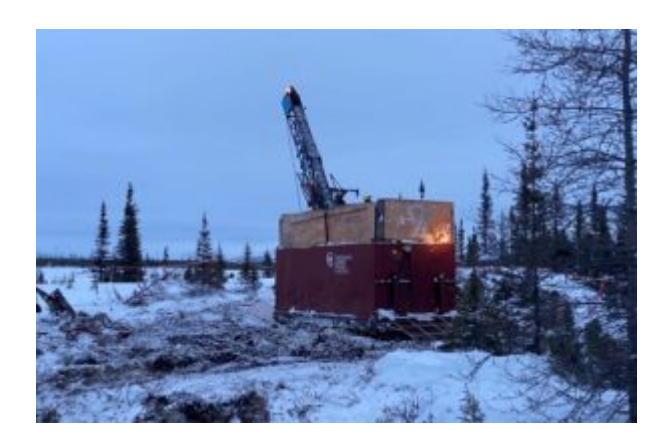
Figure 1: Drill rig at Eastmain (note the first hole, EM21-143, is located 100m from the Eastmain camp)